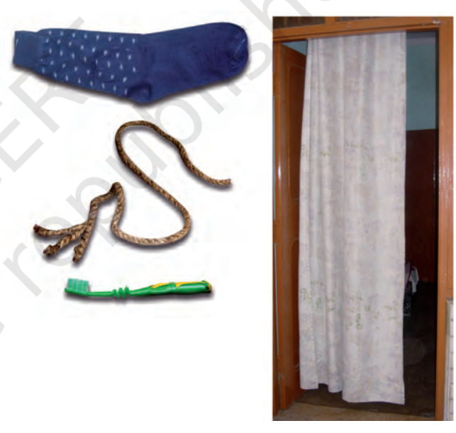
Fig. 3.3: Various articles made from nylon

We use many articles made from nylon, such as socks, ropes, tents, toothbrushes, car seat belts, sleeping bags, curtains, etc. (Fig. 3.3). Nylon is