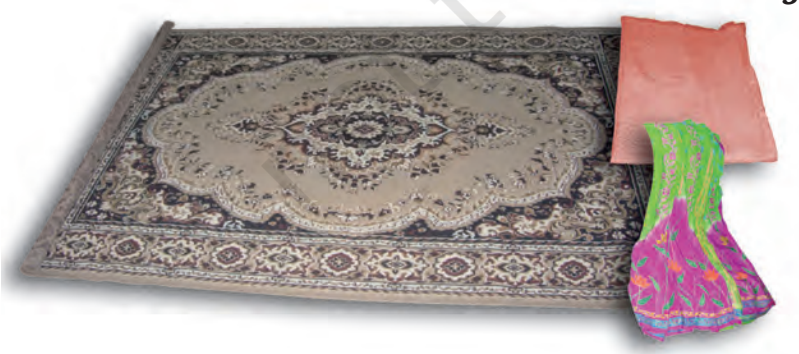
Fig. 3.2: Articles made of rayon

Is nylon fibre really so strong that we can make nylon parachutes and ropes for rock climbing?