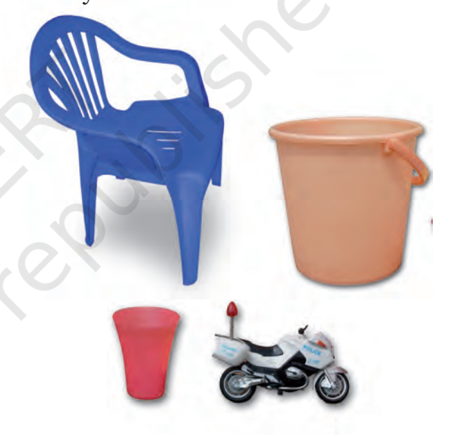
Fig. 3.7: Various articles made of plastics

Plastic is also a polymer like the synthetic fibre. All plastics do not have the same type of arrangement of units. In some it is linear, whereas in others it is cross-linked. (Fig. 3.6). Plastic articles are available in all possible shapes and sizes as you can see in Fig. 3.7. Have you ever wondered how this is possible? The fact is that plastic is easily mouldable i.e. can be shaped in any form. Plastic can be recycled, reused, coloured, melted, rolled into sheets or made into wires. That is why it finds such a variety of uses.