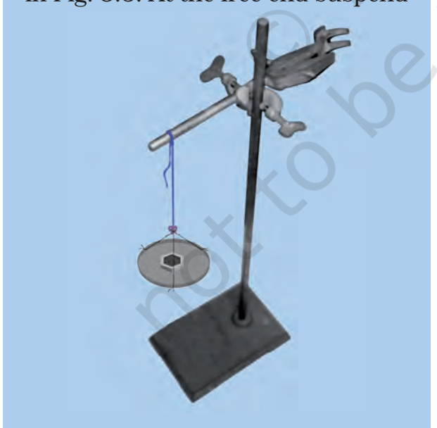
Fig. 3.5: An iron stand with a thread hanging from the clamp

Take an iron stand with a clamp. Take a cotton thread of about 60 cm length. Tie it to the clamp so that it hangs freely from it as shown in Fig. 3.5. At the free end suspend