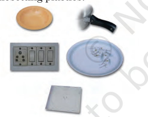
Articles made of thermosetting plastics

On the other hand, there are some plastics which when moulded once, can not be softened by heating. These are called thermosetting plastics . Two examples are bakelite and melamine. Bakelite is a poor conductor of heat and electricity. It is used for making electrical switches, handles of various utensils, etc. Melamine is a versatile material. It resists fire and can tolerate heat better than other plastics. It is used for making floor tiles, kitchenware and fabrics which resist fire. Fig. 3.8 shows the various uses of thermoplastics and thermosetting plastics.