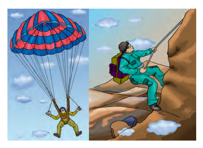
Fig. 3.4: Use of nylon Fibres

also used for making parachutes and ropes for rock climbing (Fig. 3.4). A nylon thread is actually stronger than a steel wire.