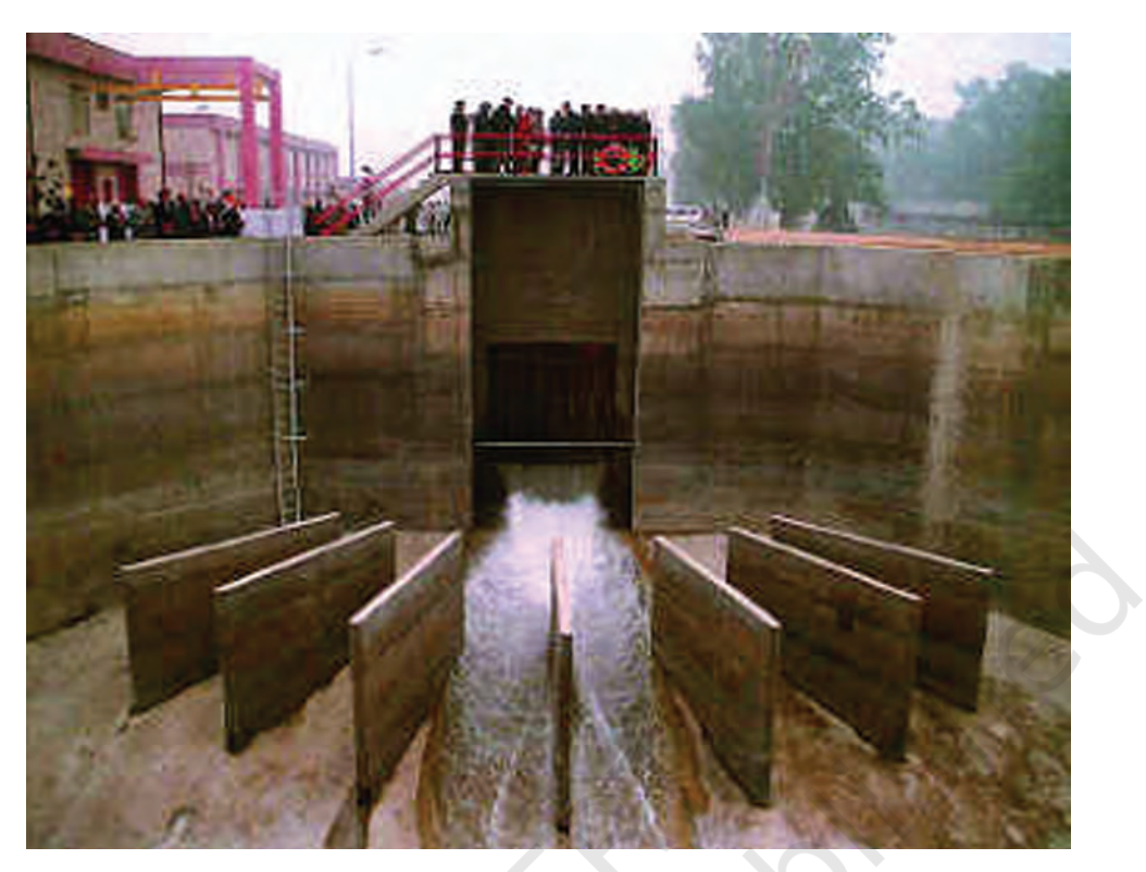
Fig. 18.10 : Water treatment plant

water used for washing vegetables may be used to water plants in the garden.