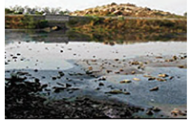
Fig. 18.9 : Industrial waste discharged into a river