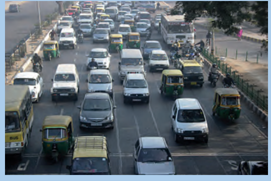
Fig. 18.1: A congested road in a city