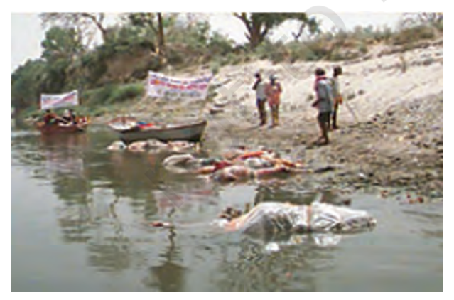
Fig. 18.8 : A polluted stretch of the river Ganga

Many industries discharge harmful chemicals into rivers and streams, causing the pollution of water (Fig. 18.9). Examples are oil refineries, paper factories, textile and sugar mills