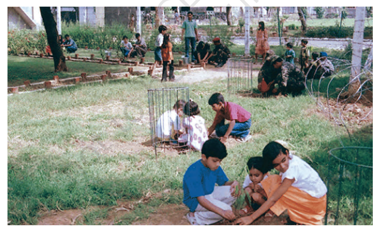
Fig. 18.6 : Children planting saplings

Small contributions on our part can make a huge difference in the state of the environment. We can plant trees and nurture the ones already present in the neighbourhood. Do you know about Van Mahotsav , when lakhs of trees are planted in July every year (Fig. 18.6)?