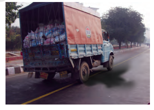
Fig. 18.3 : Air pollution due to automobiles

Vehicles produce high levels of pollutants like carbon monoxide, carbon dioxide, nitrogen oxides and smoke (Fig. 18.3). Carbon monoxide is produced from incomplete burning of fuels such as petrol and diesel. It is a poisonous gas. It reduces the oxygen-carrying capacity of the blood.