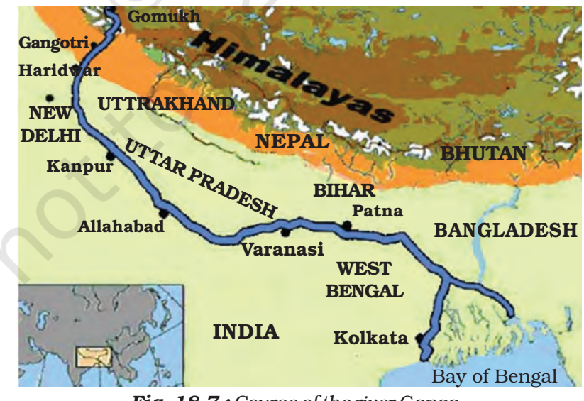
Fig. 18.7 : Course of the river Ganga

Ganga is one of the most famous rivers of India (Fig. 18.7). It sustains most of the northern, central and eastern Indian population. Millions of people depend on it for their daily needs and