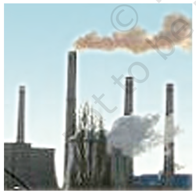
Fig. 18.2 : Smoke from a factory

The substances which contaminate the air are called air pollutants . Sometimes, such substances may come from natural sources like smoke and dust arising from forest fires or volcanic eruptions. Pollutants are also added to the atmosphere by certain human activities. The sources of air pollutants are factories (Fig. 18.2), power plants, automobile exhausts and burning of firewood and dung cakes.