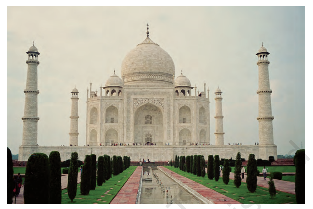
Fig. 18.4 : Taj Mahal

ordered industries to switch to cleaner fuels like CNG (Compressed Natural Gas) and LPG (Liquefied Petroleum Gas). Moreover, the automobiles should switch over to unleaded petrol in the Taj zone.