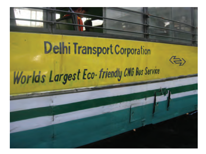
Fig. 18.5 : A public transport bus powered by CNG

There are many success stories in our fight against air pollution. For example, a few years ago, Delhi was one of the most polluted cities in the world. It was being choked by fumes released from automobiles running on diesel and petrol. A decision was taken to switch to fuels like CNG (Fig. 18.5) and