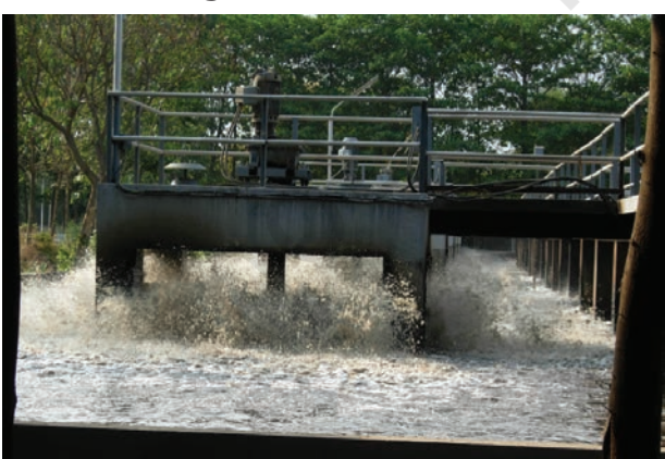
Fig. 18.6 Aerator

4. Air is pumped into the clarified water to help aerobic bacteria to grow. Bacteria consume human waste, food waste, soaps and other unwanted matter still remaining in clarified water (Fig. 18.6).