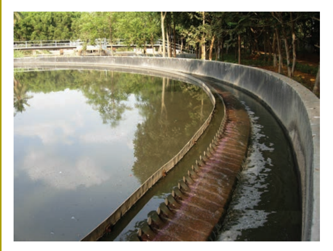
Fig. 18.5 Water clarifer

a scraper. This is the sludge . A skimmer removes the floatable solids like oil and grease. Water so cleared is called clarified water (Fig. 18.5).