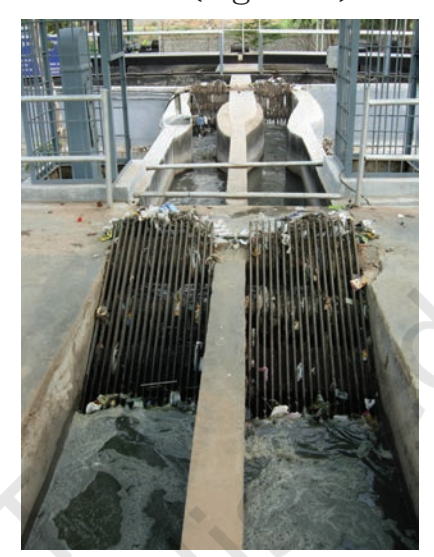
Fig. 18.3 Bar screen

1. Wastewater is passed through bar screens. Large objects like rags, sticks, cans, plastic packets, napkins are removed (Fig. 18.3).