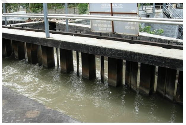
Fig. 18.4 Grit and sand removal tank

2. Water then goes to a grit and sand removal tank. The speed of the incoming wastewater is decreased to allow sand, grit and pebbles to settle down (Fig. 18.4).