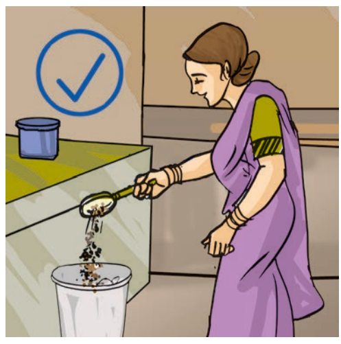
Fig. 18.7 Do not throw everything in the sink