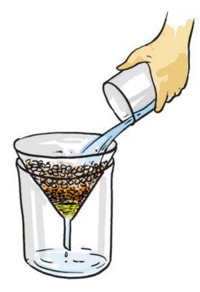
Fig. 18.2 Filtration process