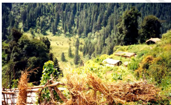
Figure 16.2 A view of a forest life

Do you think such use of forest resources would lead to the exhaustion of these resources? Do not forget that before the British came and took over most of our forest areas, people had been living in these forests for centuries. They had developed practices to ensure that the resources were used in a sustainable manner. After the British took control of the forests (which they exploited ruthlessly for their own purposes), these people were forced to depend on much smaller areas and forest resources started becoming over-exploited to some extent. The Forest Department in independent India took over from the British but local knowledge and local needs continued to be ignored in the management practices. Thus vast tracts of forests have been converted to monocultures of pine, teak or eucalyptus. In order to plant these trees, huge areas are first cleared of all vegetation. This destroys a large amount of biodiversity in the area. Not only this, the varied needs of the local people – leaves for fodder, herbs for medicines, fruits and nuts for food – can no longer be met from such forests. Such plantations are useful for the industries to access specific products and are an important source of revenue for the Forest Department.