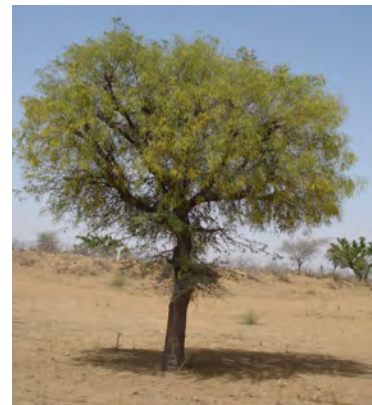
Figure 16.3 Khejri Tree

We need to accept that human intervention has been very much a part of the forest landscape. What has to be managed in the nature and what may be the extent of this intervention? Forest resources ought to be used in a manner that is both environmentally and developmentally sound – in other words, while the environment is preserved, the benefits of the controlled exploitation go to the local people, a process in which decentralised economic growth and ecological conservation go hand in hand. The kind of economic and social development we want will ultimately determine whether the environment will be conserved or further destroyed. The environment must not be regarded as a pristine collection of plants and animals. It is a vast and complex entity that offers a range of natural resources for our use. We need to use these resources with due caution for our economic and social growth, and to meet our material aspirations.